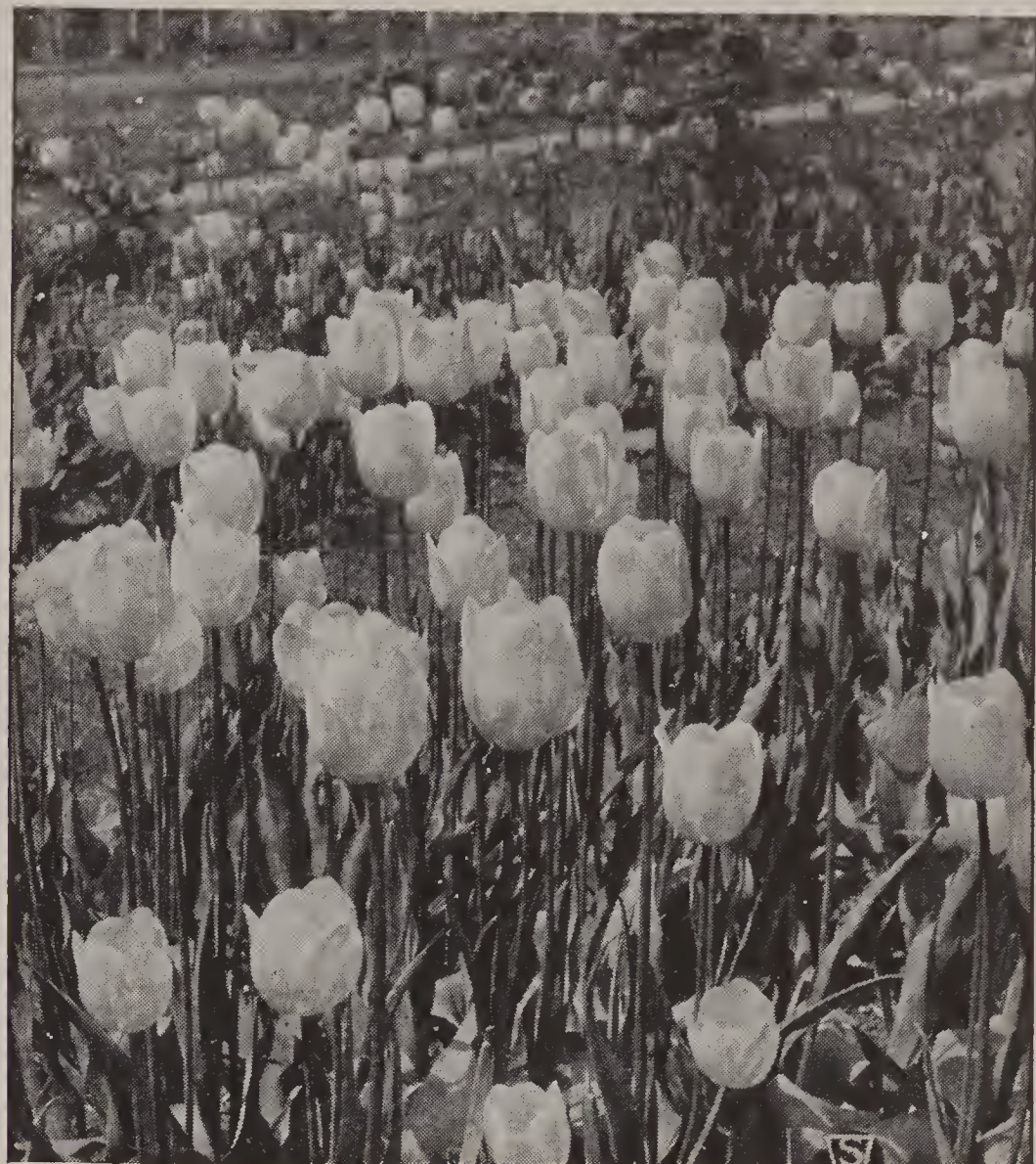
Big bowl-like flowers of the Giant Darwins

MAHOGANY. A very large flower of true Darwin form, of a rich deep shade of mahogany, with a darker base. Excellent for exhibition. $4.00 for 10; $35.00 per 100